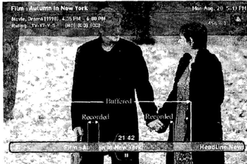
Fig. 7. PVR User Interface

Figure 7 above depicts time information (4:35 PM – 6 PM) for a currently viewed program and also depicts a progress bar that indicates distinctions between merely buffered and permanently “[r]ecorded” areas of program. Id. A moving pointer indicates “the current playing position.” Id.